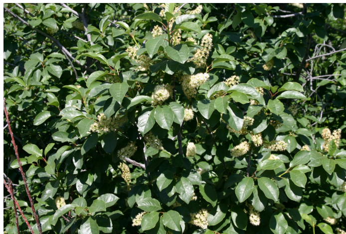
Figure 10: Chokecherry ( Prunus virginiana ) is a small tree or shrub that grows in thickets and along waterways. It can grow up to 5 m tall and the leaves are ovate to obovate with minimally serrate margins. The bark is grey with obvious lenticles. The inflorescence is a cylindrical raceme of white fragrant flowers that ripen into dark purple round fruits. The fruit is the only edible portion.

Figure 9: Arrowgrass ( Triglochin maritima ) is found throughout North America in moist marshlands and pastures. It is a perennial grass-like plant and the leaves are between 15 and 30 cm long, linear, unjointed and sheathed at the base. The flower is composed of a pediceled raceme that may grow up to 1.5 m tall. The greenish flowers are inconspicuous and ripen into greenish fruits. Cyanide is highly toxic to all animals as it inhibits cellular respiration. Affected animals cannot use oxygen and develop “cherry red” tissues and blood. Low, non-lethal doses of cyanide have been associated with lathyrism-like disease, goiter, birth defects such as arthrogryposis, and spinal cord degeneration and cystitis. The mechanism of many of these changes is due to damage to nerve coverings called myelin sheaths.