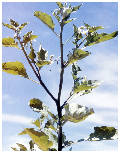
Figure 7: Black nightshade ( Solanum nigrum ) is a spineless erect or trailing annual plant that grows along fences and roads and on the disturbed margins of fields. It has a small white flower that ripens into a 0.5 to 1 cm round smooth green fruit that contains the toxin, solanine. When the fruits turn black, they are edible.

Milkweeds ( Asclepias spp.) and other cardiac glycoside containing plants: Milkweeds (Figure 8) can be found throughout the world as they grow along roadsides, waterways and in disturbed areas. Most species contain cardenolides or cardiac glycosides, but the concentrations of these vary between the species and plants. These toxins are similar to digoxin (the toxin in