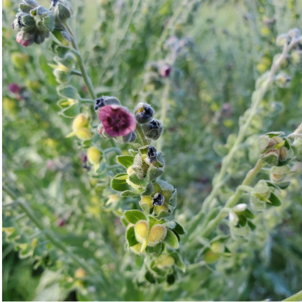
Figure 3: Hound's tongue ( Cynoglossum officinale ) is a biennial noxious weed originally from Euroasia that has spread throughout North America. The leaves of the first year rosette are long (40+ cm) and broad, hence the common name. In its second year the plant produces flowering stems that are about 0.5 m tall and topped with reddish purple flowers that ripen into small 8-10 mm nutlets that are covered with hooked barbs that easily attach to hair and clothing.

Most PA containing plants are invasive noxious weeds of varying toxicity making it difficult to predict the risk and the extent or effect of poisoning. Animal and individual susceptibility to poisoning also differs. Horses and cattle are more susceptible than sheep and goats. Young animals are often much more susceptible than mature animals and there are reports of transmammary neonatal poisoning without