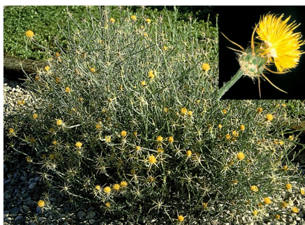
Figure 12: Yellow star thistle (left) ( Centaurea solstitialis ) is a noxious weed from the Mediterranean that is well established in the western United States. It grows in disturbed areas along fields, roads and waste areas. It is an annual branching herbaceous weed that grows about 30 cm tall. The leaves vary from deeply lobed at the base to linear and entire on the stems. The flowers are yellow and the bracts

Figure 11: Russian knapweed (right) ( Centaurea repens ) is a Russian plant that has invaded many parts of the world. It is a perennial erect plant whose branches can grow to about 1 m tall. The leaves are alternate with toothed margins. The thistle like flowers are 1-2 cm in diameter and range from lavender to white. The seeds are white with bristles on one end.