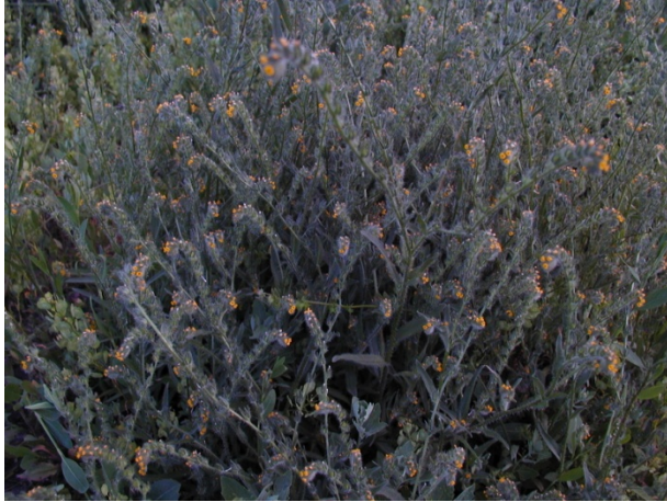
Figure 5: Fiddleneck ( Amsinckia intermedia ) is an annual that has spread over much of the southwest. The flower is yellow or orange and it is shaped like the neck of a fiddle resulting in the common name- fiddleneck. Poisoning is sporadic and most often affects highly susceptible young animals especially horses. When other forages are lacking, resistant animals often seem to eat fiddleneck without problems, but it is likely that such subclinical poisonings have permanent sequelae that may not be seen until months or years later. Fiddleneck contains various PAs including intermedine and echiumine. Similar Australian plants suggests that these toxins have the potential to contaminate honey and pollen.